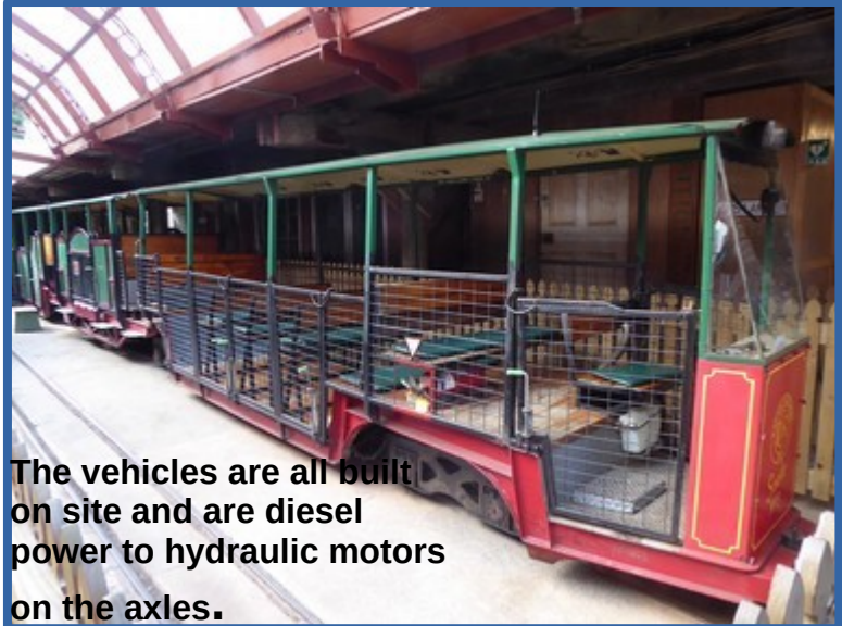
The vehicles are all built on site and are diesel power to hydraulic motors on the axles.