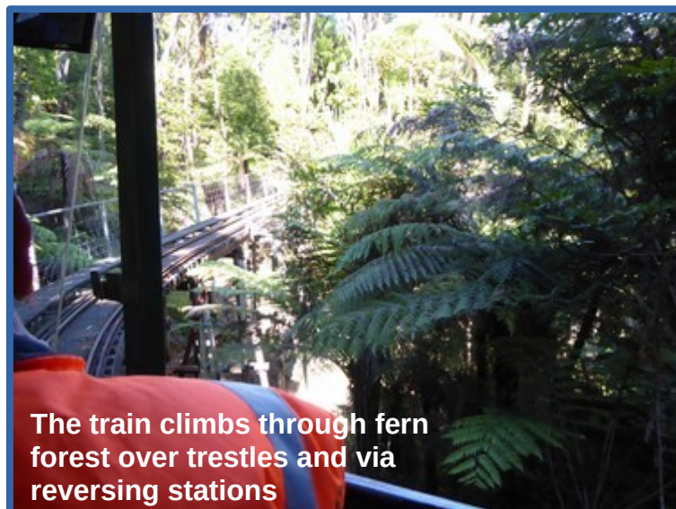
The train climbs through fern forest over trestles and via reversing stations