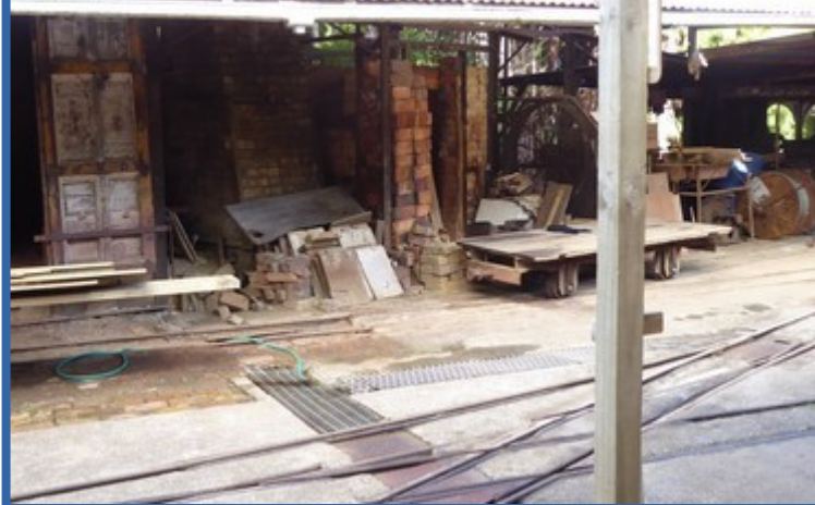
Here are the kilns which are why it all started