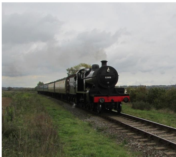
S&D 7F 53808