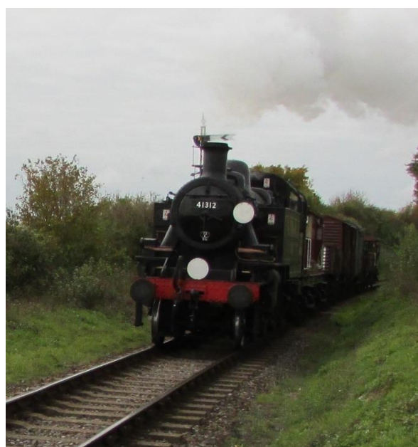
Ivatt 2-6-2T 41312