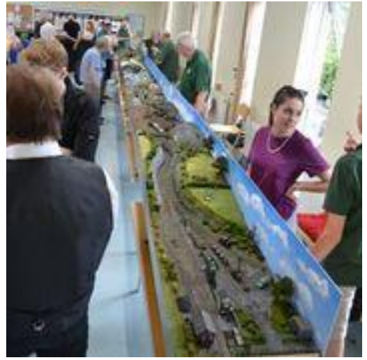
Club's "Straight and Narrow" modular layout