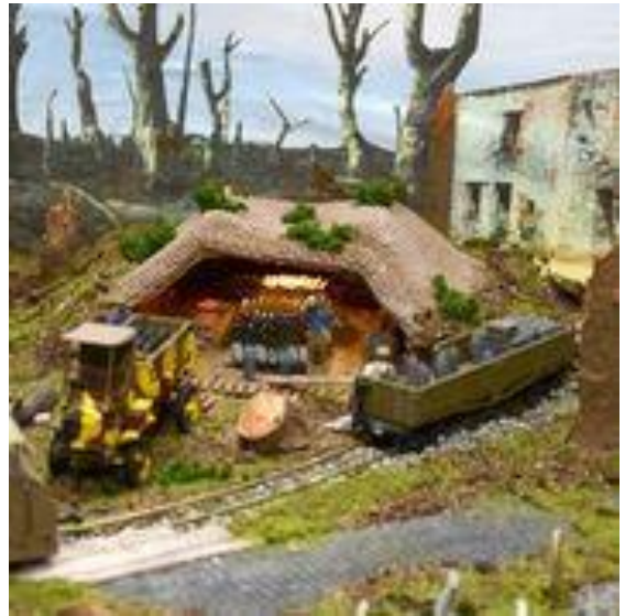
Somewhere in France