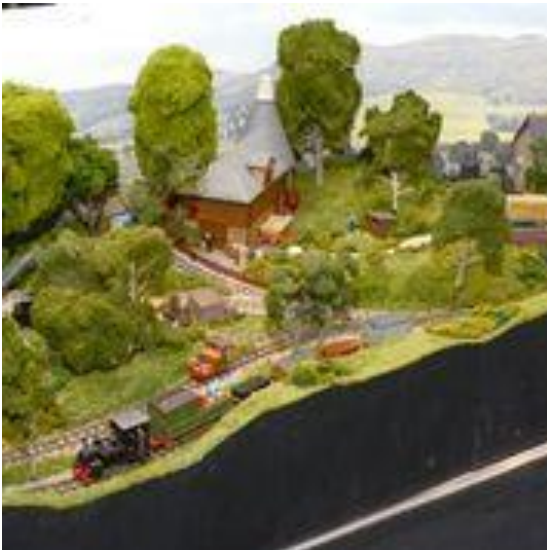
River Crane Mill